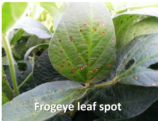
Frogeye leaf spot