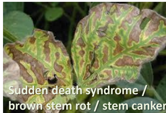
Sudden death syndrome / brown stem rot / stem canker