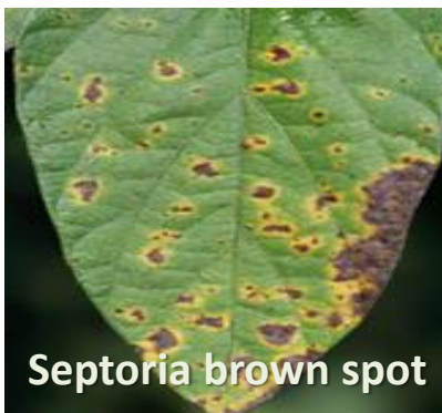
Septoria brown spot

*Yield response depends on the presence of the pathogen, the susceptibility of the cultivar, and whether or not environmental conditions are conducive for disease development. Soybean foliar fungicide advisories will be available in 2015 on the Virginia Ag Pest and Crop Advisory Blog ( http://blogs.ext.vt.edu/ag-pest-advisory/ ).