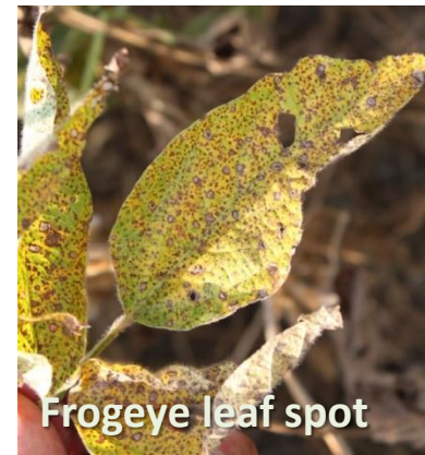
Frogeye leaf spot