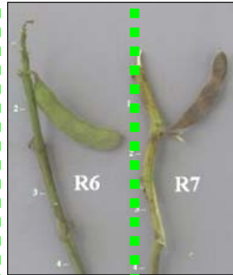
R6 full seed